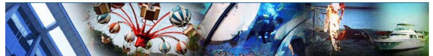
INTEGRATION – LESS RESOURCES FOR MORE INFORMATION

In order to develop an integrated tourism area, the Company establishes an inventory land bank policy by increasing land assets through reclamation and land purchase which is expected to give positive impact for the company business. In addition to revitalizing the existing site as public recreation facility, the development also performed to increase the number of visitors.